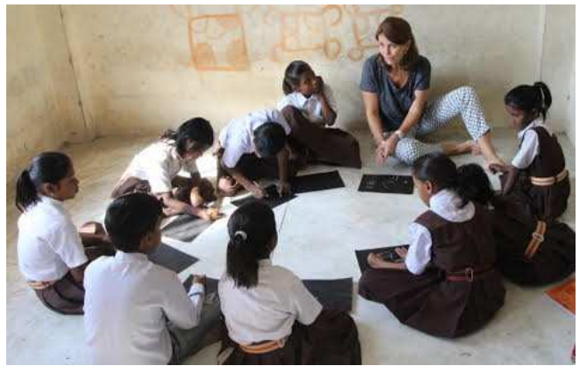
It is with great pleasure that I now introduce our

2016 graduating class! I feel very proud of this group of ten youngsters. They have been studying so hard