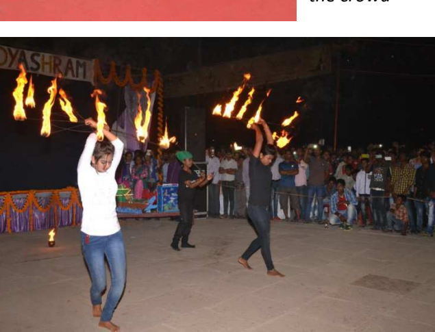
part of our fire show finale