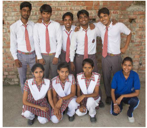
Our first class to graduate from 12<sup>th</sup> grade!

Finally, I want to share the joy of our first class to complete high school. In 2012, our first batch graduated from Asha Deep and transferred to a local high school. We expect all nine of that original class to graduate this year. They have been taking their national board exams during the month of March and have just two exams left. Considering that these are the children of uneducated parents, this is a very big accomplishment! One of them still has aspirations to be a chef. One plans to become a photographer. Four plan to continue to university to