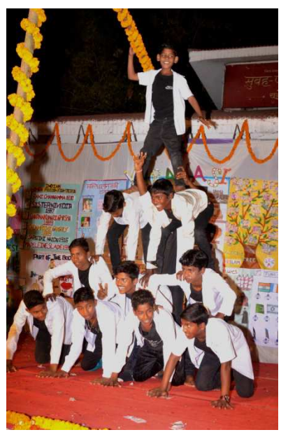
Boys dancing to a song about hopes and dreams

A few days after our performance, a group of seven women from Singapore came to visit our school. Similar to what they did during their last visit, the group came prepared to teach a variety of arts and crafts. They also brought several