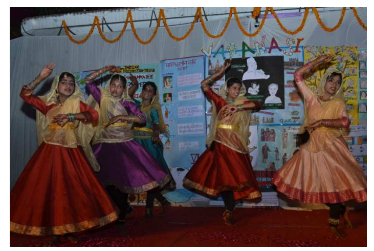
Girls performing classical Indian dance